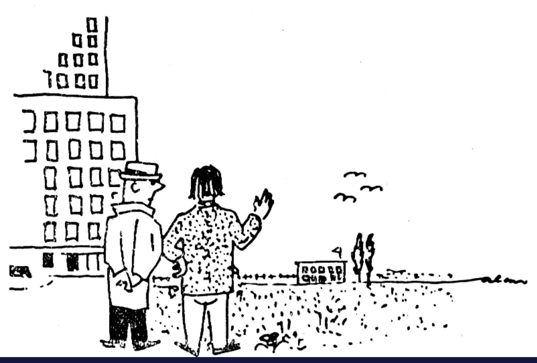
No, the health center is the building on the right. On its left is the health management building