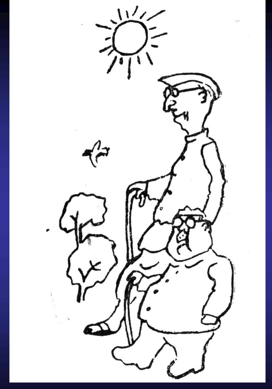
On the weekends we too become rural oriented