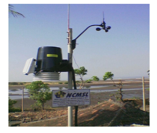
Figure-3: Automatic Weather Stations (AWS)

Picture of Automatic Weather Stations (AWS) installed at Harni (Ratnagiri dt of Maharashtra) National Collateral Management Services Limited (NCMSL) is provided in Figure-3 below: