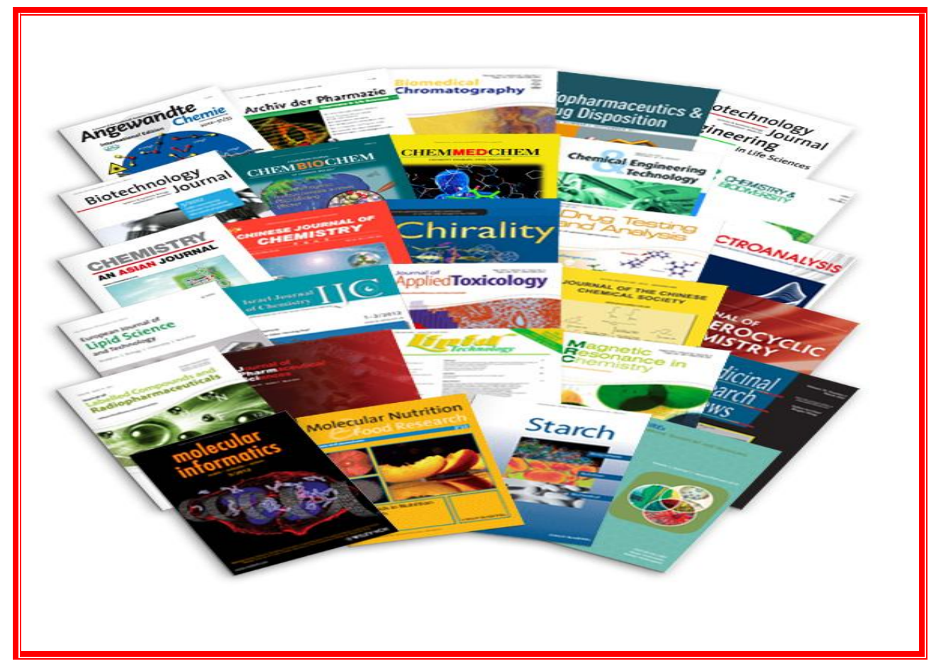
TABLE OF CONTENTS-FEBRUARY2014