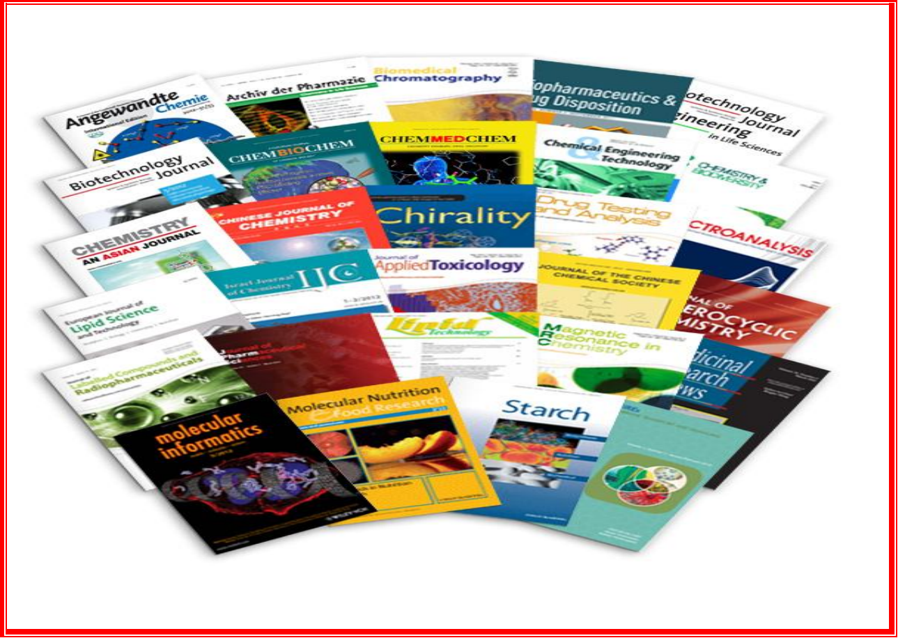
TABLE OF CONTENTS-MAY-2014