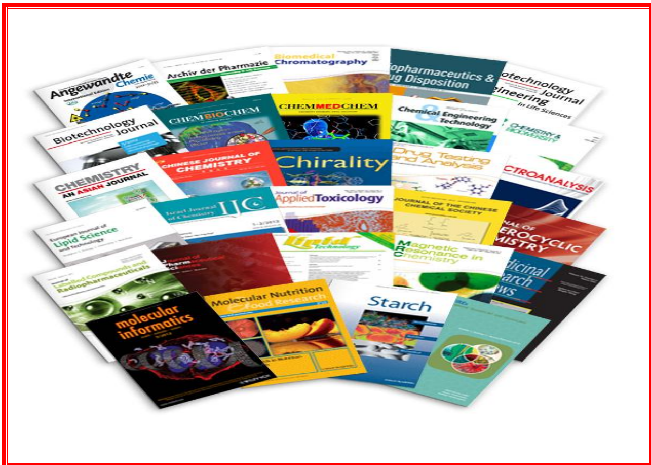
TABLE OF CONTENTS-SEPTEMBER-2014