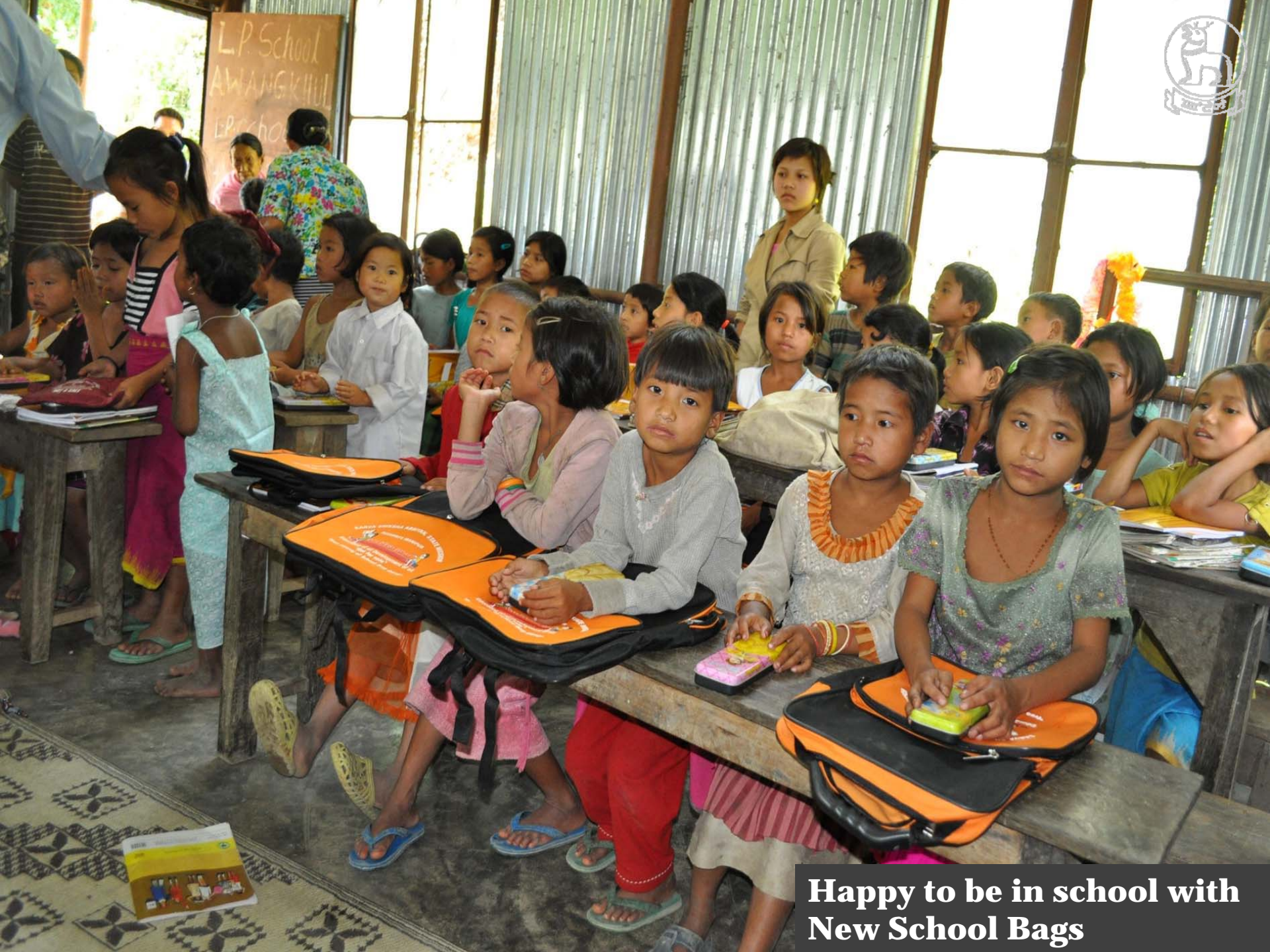
Happy to be in school with New School Bags