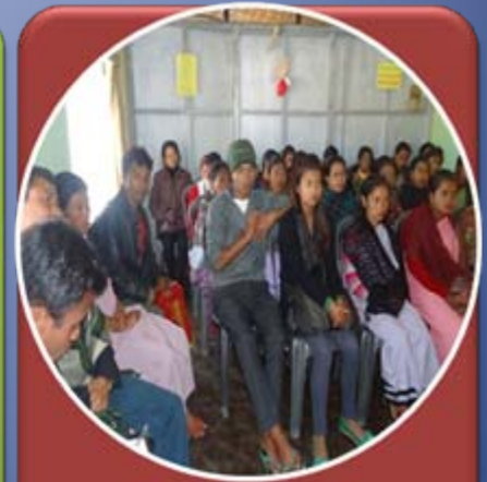
Short-term Job Oriented Scheme