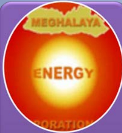
Apprentice Training Scheme (ATS)