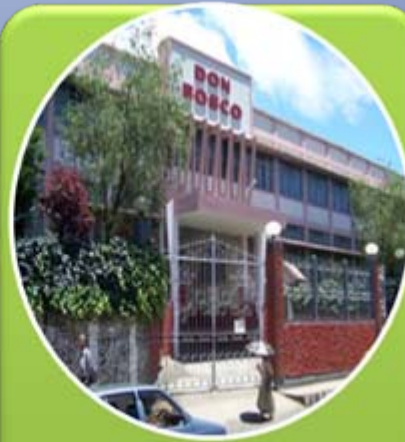
Skill Development Initiative Scheme (SDIS)