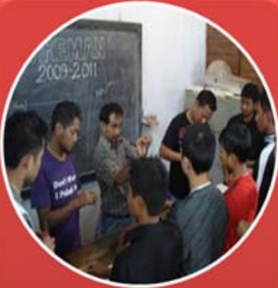
Craftsmen Training Scheme (CTS)