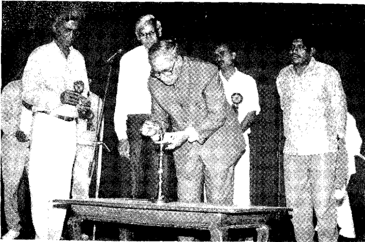
Hon'ble Minister of State for Planning & Programme Implementation, Shri H.R. Bhardwaj, inaugurating the Annual Day Function.