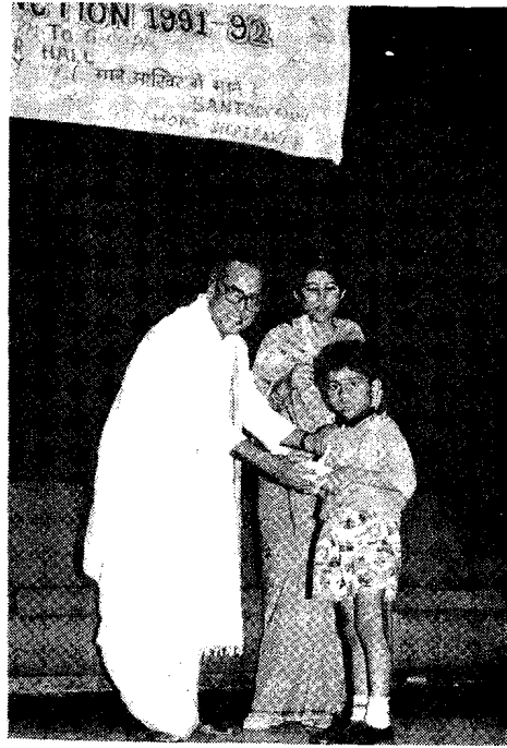
Hon'ble Deputy Chairman, Planning Commission, Shri Pranab Mukherjee, giving away a prize.