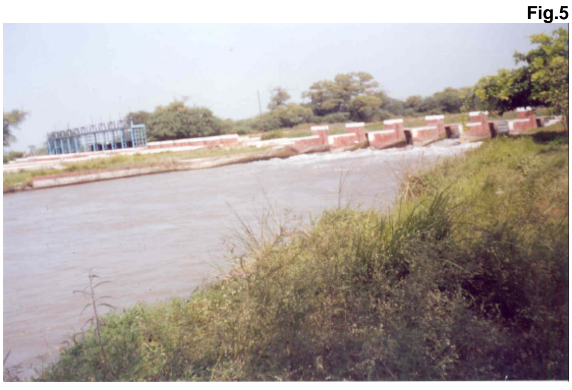
Head JLN & BSB