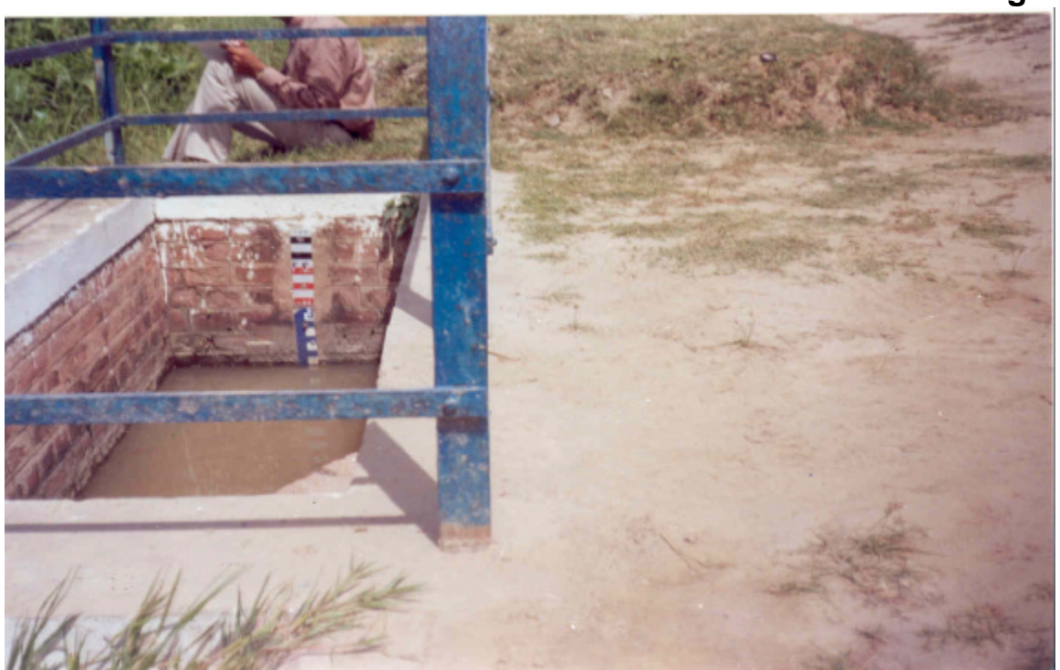
Gaugewell at Tail Parallel Delhi Branch