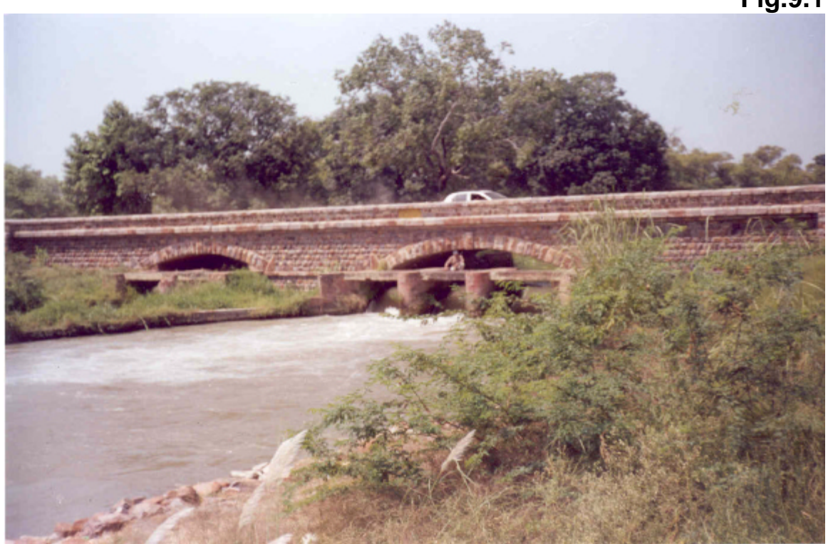
Delhi Branch U/S Cross Regulator.