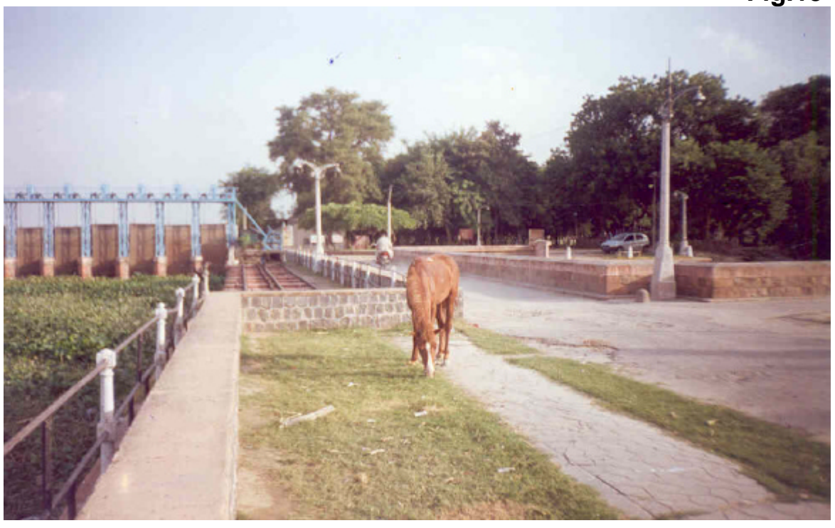
Okhla Headworks for Agra Canal carrying WJC & UGC waters