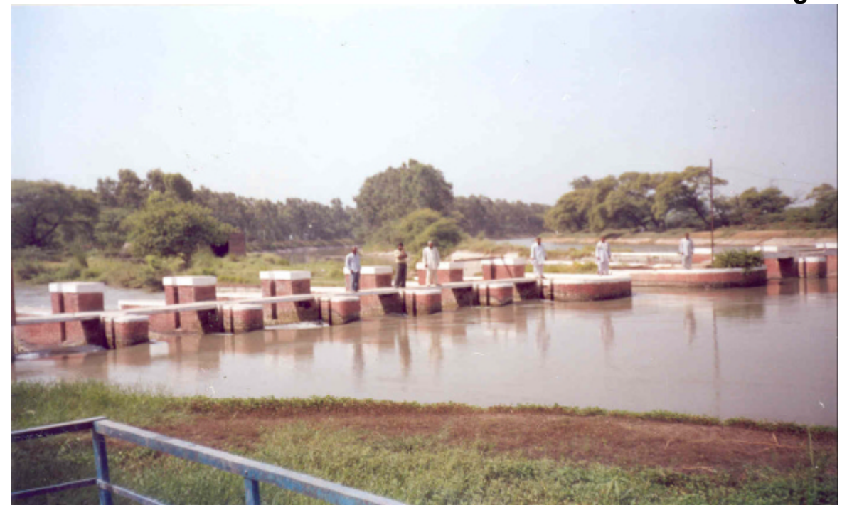
Trifurcation at tail PDB, of three branch canals i.e. Head JLN, Head BSB Head Delhi Branch & Two Distys.