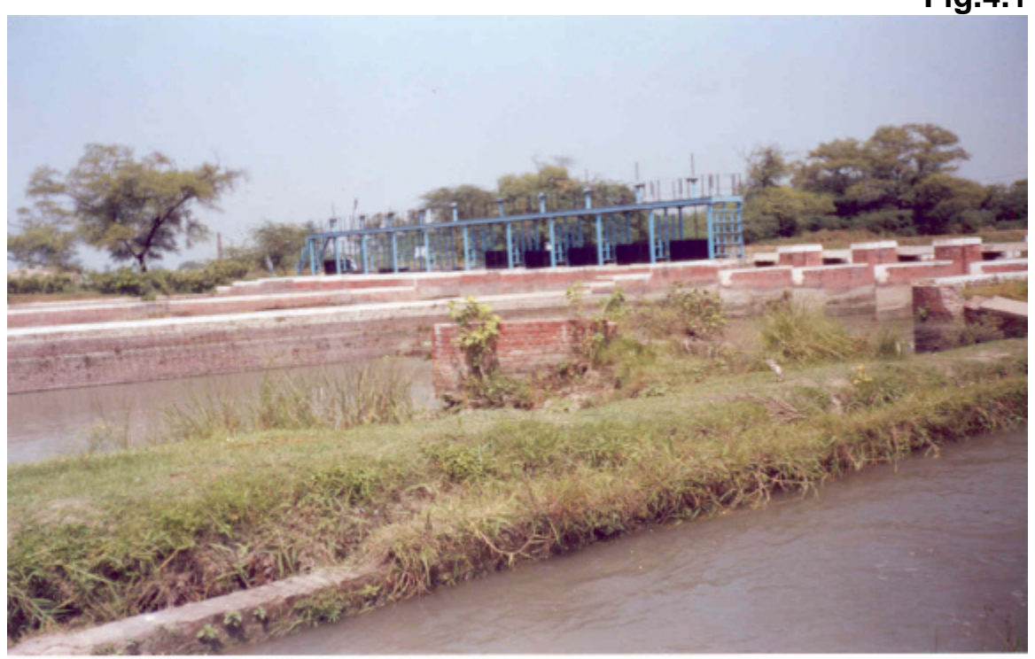
Trifurcation at tail PDB, of three branch canals i.e. Head JLN, Head BSB Head Delhi Branch & Two Distys.