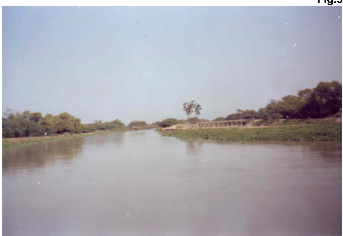
Tail Reach Parallel Delhi Branch