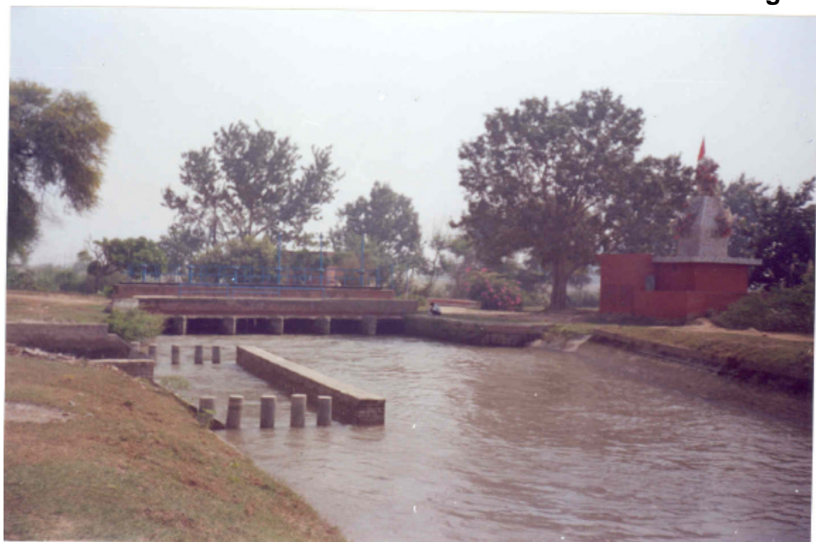
Bifurcation of Sub Branches