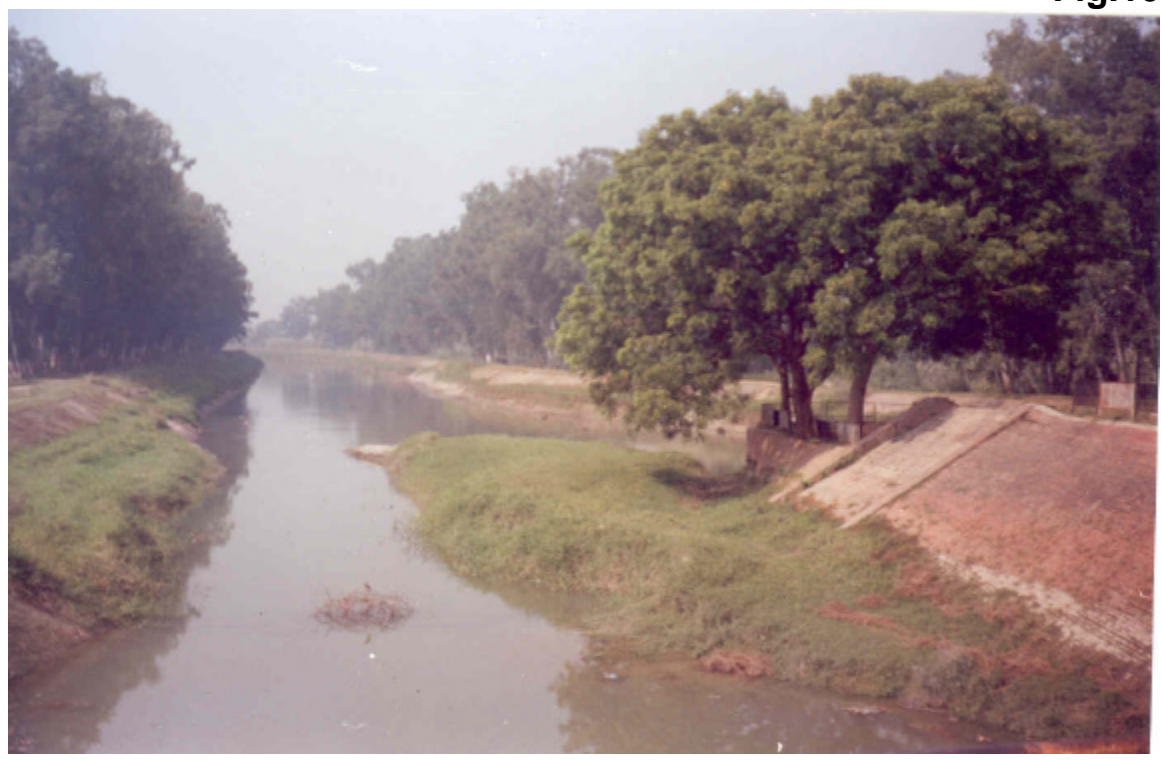
Delhi Branch D/S Cross Regulator