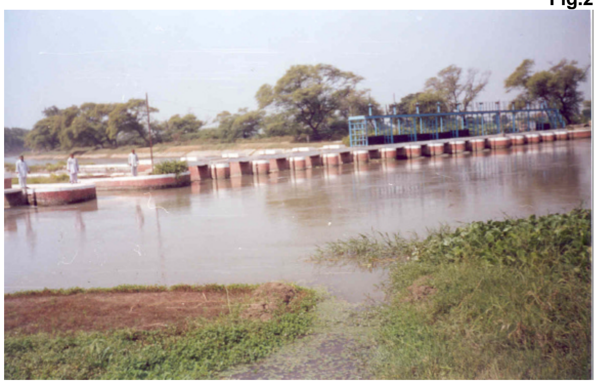
Important Control Points & Discharge Sites (Khubru) RD 145 Parallel Delhi Branch