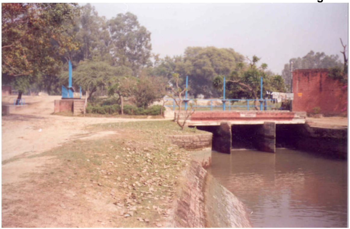
Bifurcation of Sub Branches