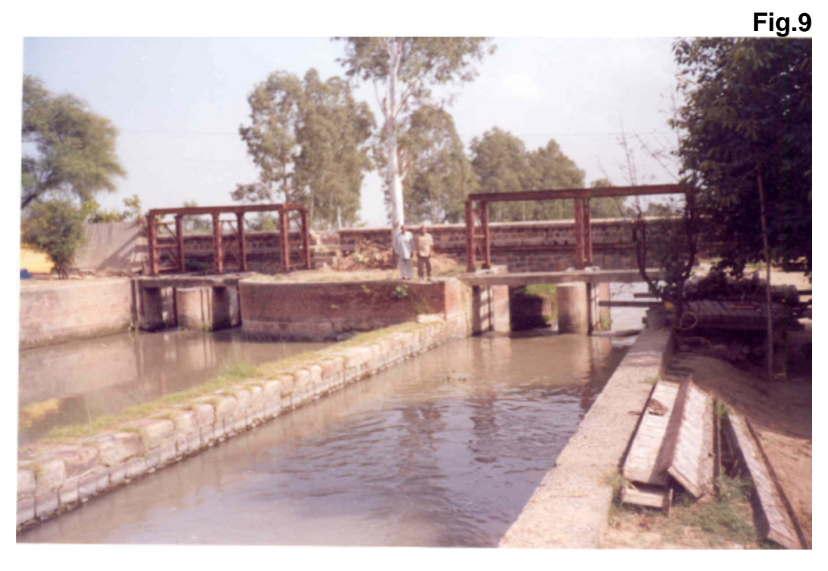
Delhi Branch U/S Cross Regulator.