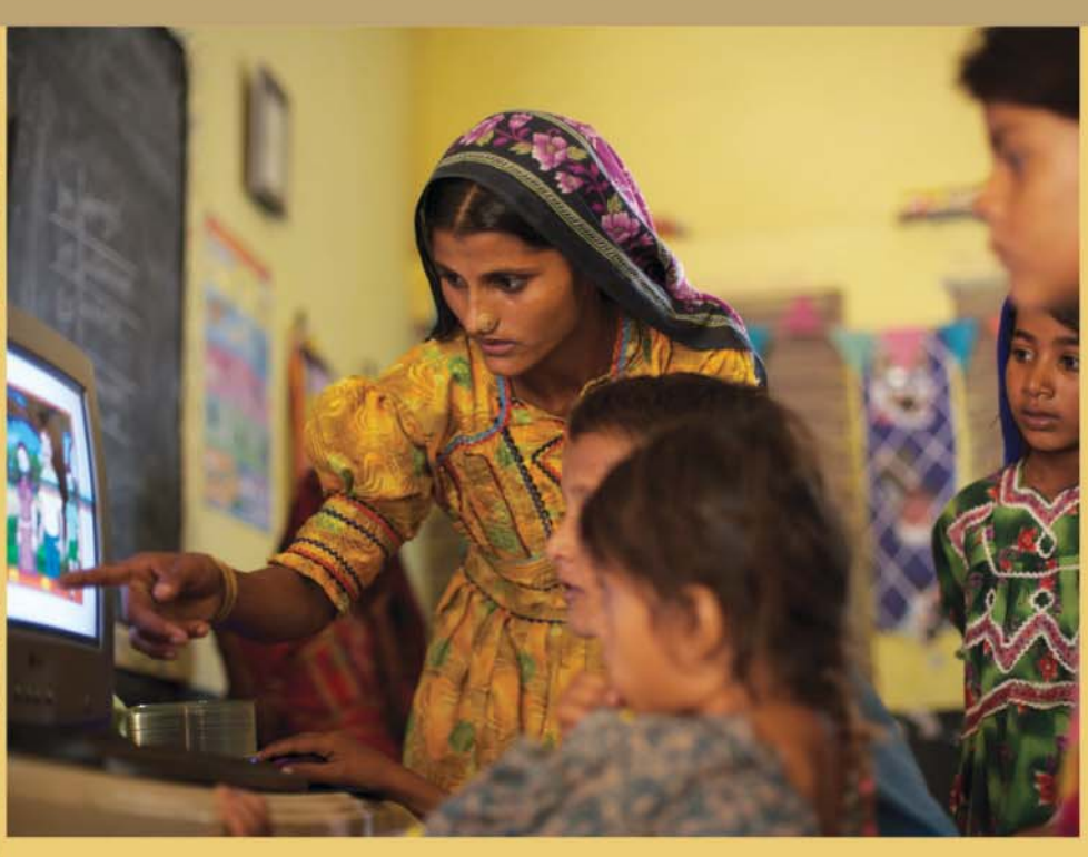
Analysis to Action